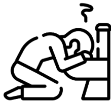
Can't keep fluids down