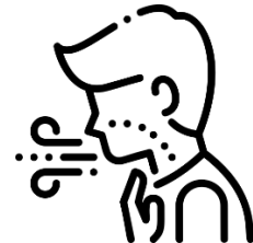
Other serious symptoms

Call 911 if you are experiencing any symptoms that require emergency assistance, such as: