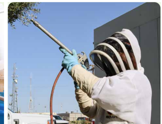
Vector Control Technician